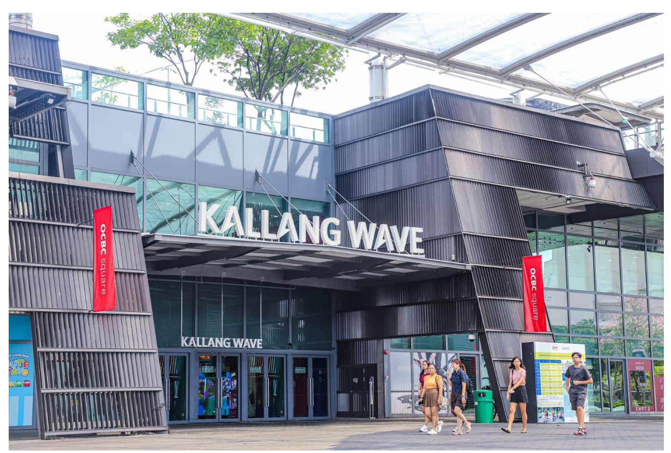
The 41,000 square metres Kallang Wave Mall at the Singapore Sports Hub is the place where visitors can shop, dine and play. It is Singapore's first ever mall that offers visitors sporting, lifestyle and entertainment activities under one roof. Besides having a diverse selection of food and beverages, fashion brands and a hypermart, there is also an indoor rock-climbing wall in the mall.